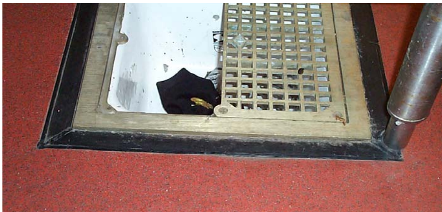
Finished Floor Drain

Note: Gulley Angle/Edge must be fully adhered to the inside of the saw cut groove and onto the substrate. All joints, flooring to Gulley Angle/Edge, as well as the angled corners of the Gulley Edge must be welded, failure to do so may allow water to encroach under the flooring, thus compromising the integrity of the flooring and Gulley Angle/Edge.